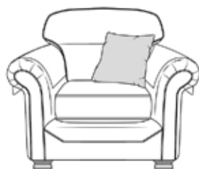
Armchair H:103 x W:102 x D:90 (cm) x1 Small Scatter Cushion