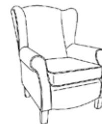
Sherwood Accent Chair - Large H:114 x W:88 x D:98 (cm) Body or Accent Fabric