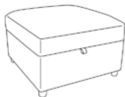
Small Storage Footstool H:43 x W:66 x D:66 (cm) Body Fabric Only