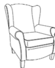
Sherwood Accent Chair - Small H:101 x W:82 x D:92 (cm) Body or Accent Fabric