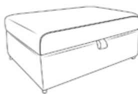
Large Storage Footstool H:43 x W:92 x D:66 (cm) Body Fabric Only